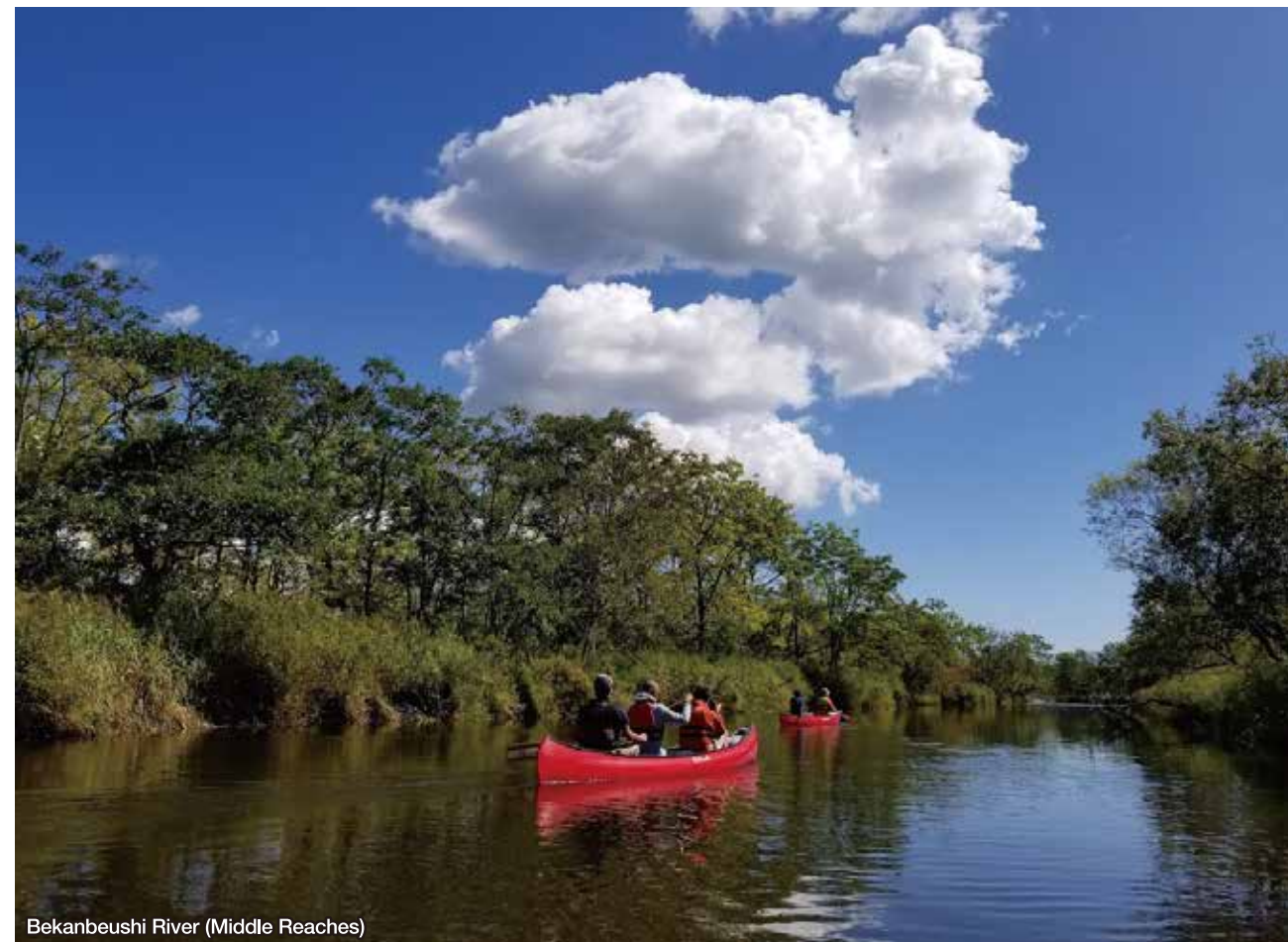
Bekanbeushi River (Middle Reaches)

Enjoy exhilarating horse trekking by the seaside, feeling the refreshing sea breeze.