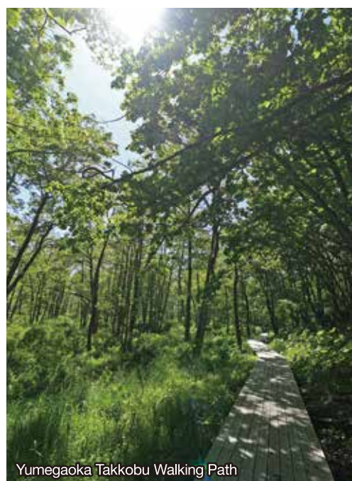
Yumegaoka Takkobu Walking Path

Experience the snowy world of the Kushiroshitsugen Wetland in the tributary of the Kushiro River through a canoeing course.