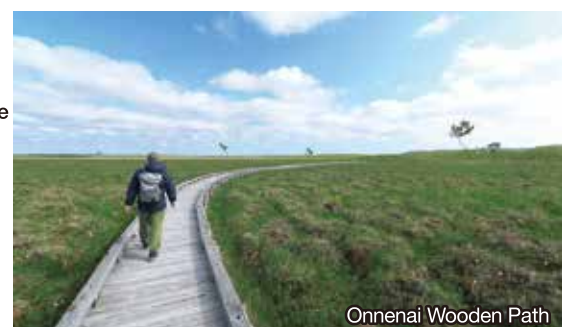
Onnenai Wooden Path

A boardwalk through the wetland that feels like walking towards the horizon.