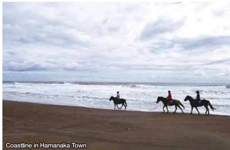
Coastline in Hamanaka Town

The wetland where the mirror-like surface turns red during sunset.