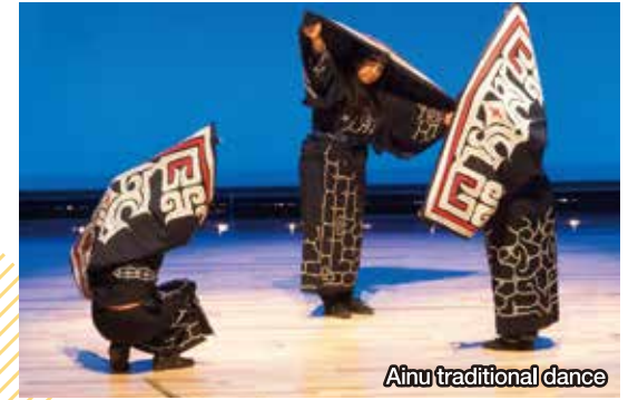
Ainu traditional dance