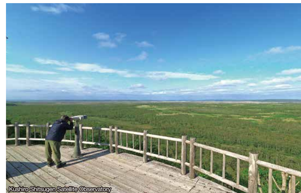
Kushiro Shitsugen Satellite Observatory