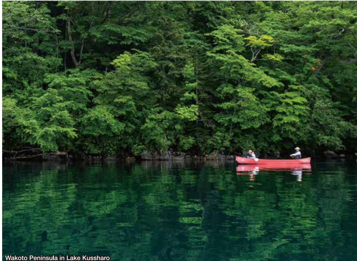
Wakoto Peninsula in Lake Kussharo